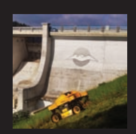
Dams and water reservoirs