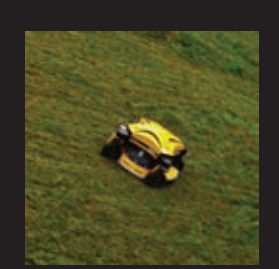
Landfills and mines