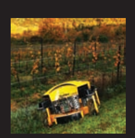
Orchards and vineyards