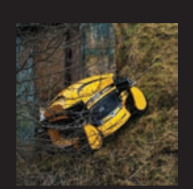
Military areas and airports